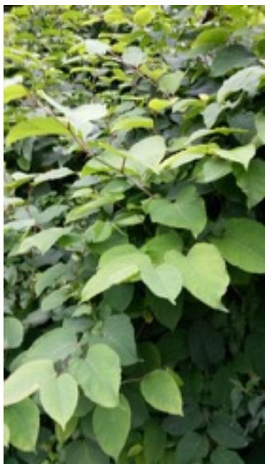
Japanese Knotweed on the Reserve.

The Rangers have been busy around the Reserve, as you can see, but there is a lot being done 'behind the scenes' as well; clearing some shrubs, trees and making habitats to encourage all the creatures and birds to thrive. Also we will be repairing more of the tow path soon. The Friends of Forest Farm have bought the Rangers some scalplings and dust to repair the towpath (Thanks!)