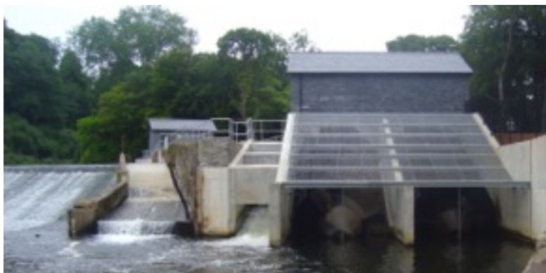
Photo shows part of Radyr weir (far left), the channel for eels and lampreys, the new fish pass and then the 2 Archimedes screws (far right) with the ancillary buildings for generating electricity and monitoring the fish behind.

As you know this scheme necessitated closing part of the Taff Trail while the work was being carried out, but it is now fully open again.